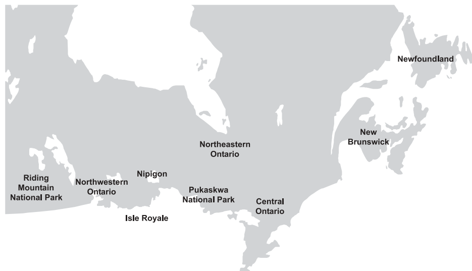
Fig. 1. Map indicating the geographic regions in which moose ( Alces alces ) were sampled for this study.

distance among moose populations was also analysed in GENEPOP version 3.1b (Raymond and Rousset 1995). Nei's unbiased genetic distance (Nei 1978; Takezaki and Nei 1996) was calculated using the program GENETIX 3.3 (Belkhir et al. 1999), and a neighbor-joining tree was constructed in the computer program PHYLIP, using the program NEIGHBOR (Felsenstein 1993).